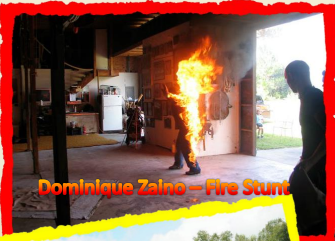
Dominique Zaino – Fire Stunt