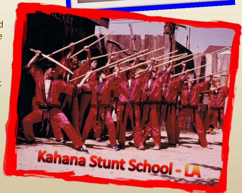
Kahana Stunt School - LA